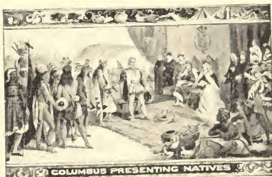
COLUMBUS PRESENTING NATIVES